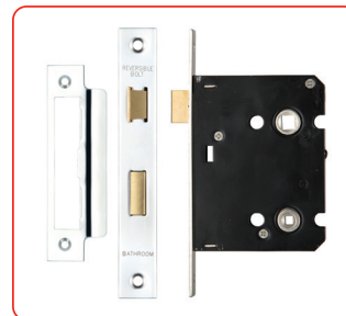
Polished Stainless Steel