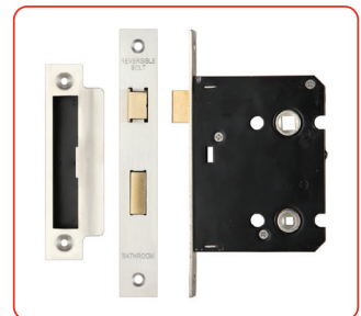
Satin Stainless Steel