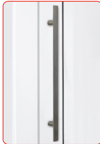
Flat Inline Handle