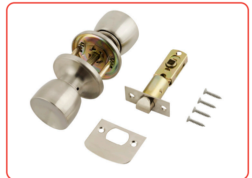
Passage Knob Set and Tubular Latch