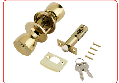
Entrance Lock Set and Tubular Latch