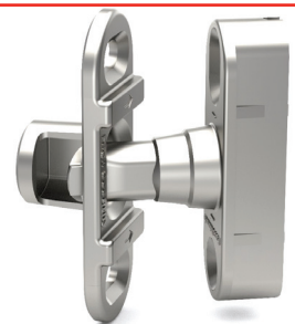
Bolt and Keep