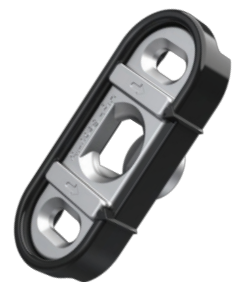
Profile Specific Packer