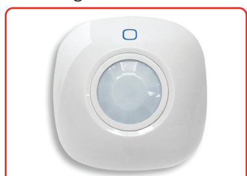
Curtain PIR Motion Sensor