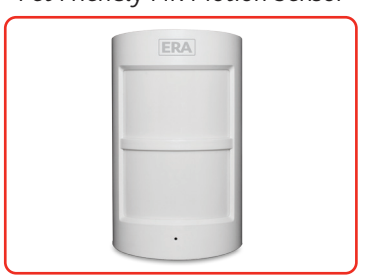
Ceiling PIR Motion Sensor